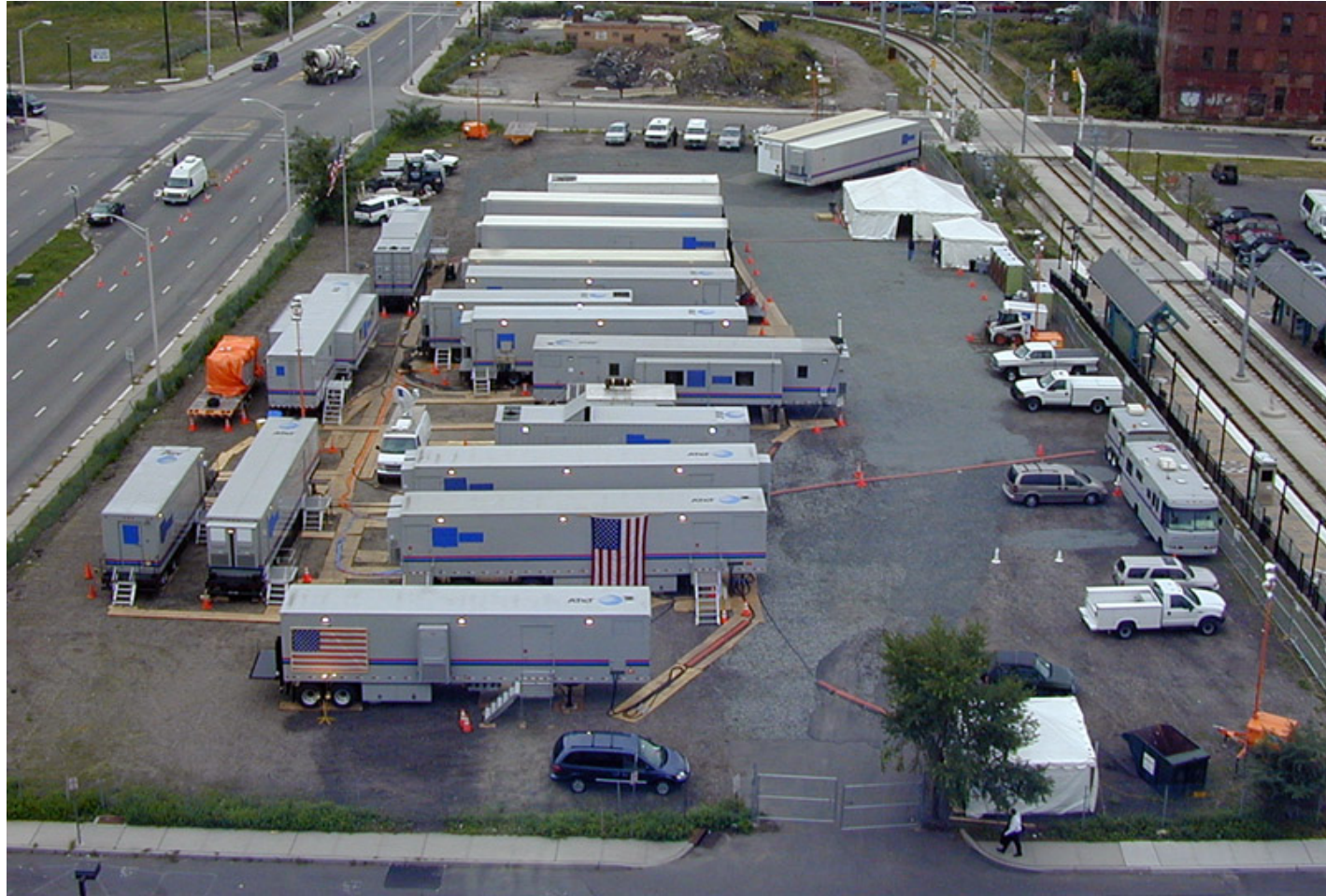
Visible Logos Masked & Covered